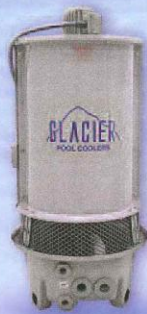
"ICE CUBE" GPC-23

Pool Size: 10-20,000 gal. (30gal. / min.)