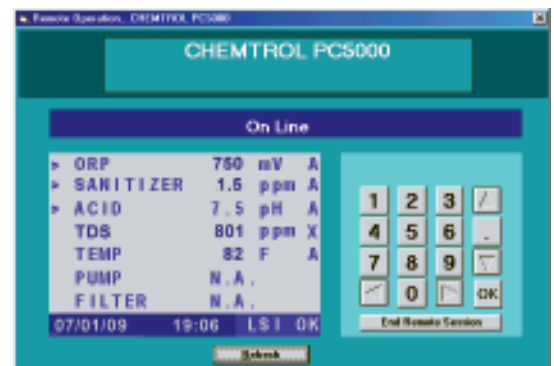
REMOTE COMPUTER OPERATION

Visit our Web Site at www.sbcontrol.com or call today for a free demo CD.