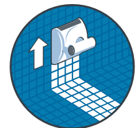
Floor and Wall Cleaning