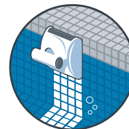
Water line Cleaning