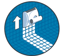
Floor and Wall Cleaning