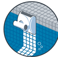
Water line Cleaning